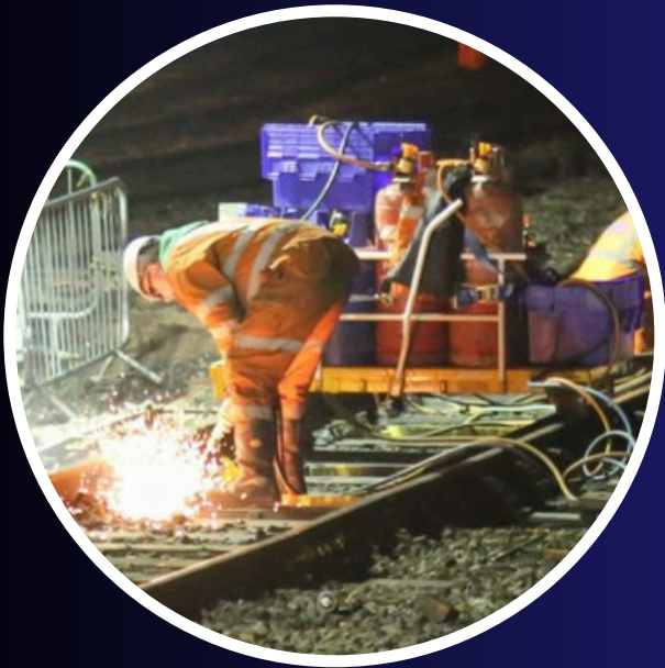
RAILWAY & CIVIL ENGINEERING