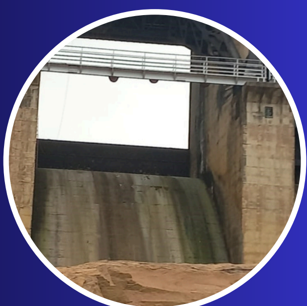
HYDRO POWER PROJECT